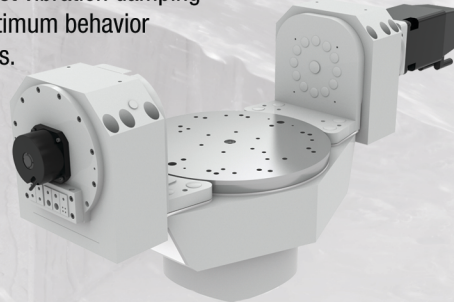
V5 Graphite Version Units: mm [inch]

Standard 4th/5th Axis Unit Accepts 15.7" sq. pallets for automation that can load from the right side of the machine.